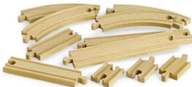
Some wooden pieces

To fit together, each male connector must be connected to a female connector. Unlike real wooden tracks, our pieces are assumed to be flexible, so their length or shape is not an issue here. However, you may not connect the two ends of the same piece together.